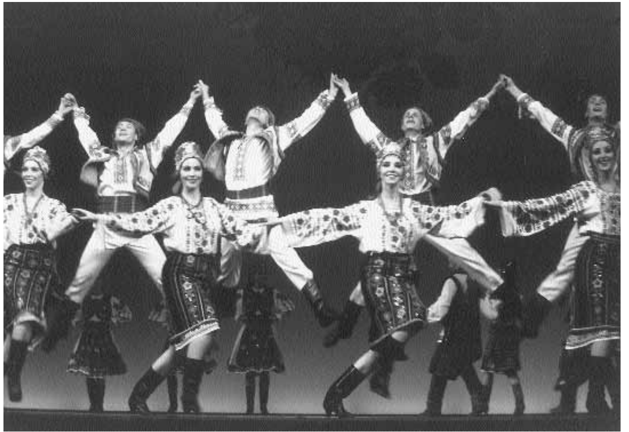
Virsky dancers perform a segment from the dance "The Carpathians."