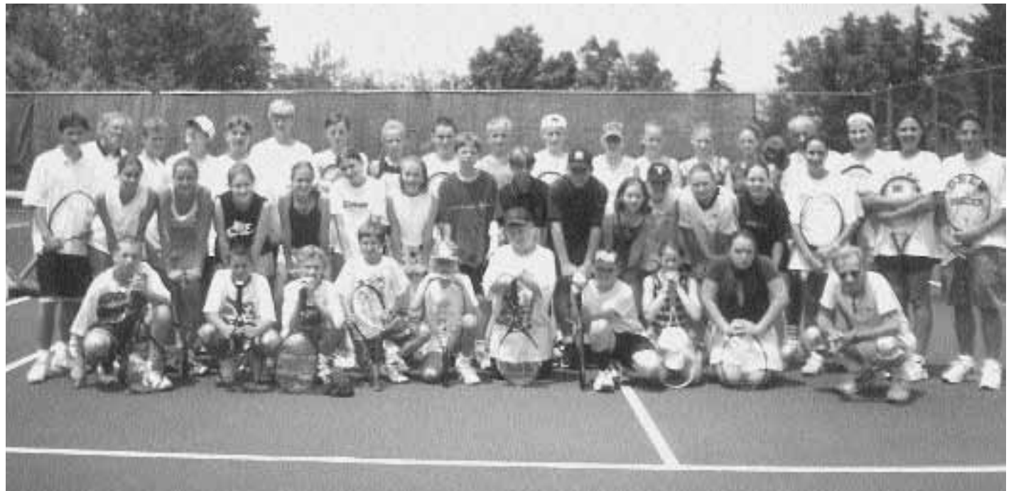
The participants and staff of the 1998 Tennis Camp held at Soyuzivka.

During the final days of the camp, participants competed in a tennis tournament