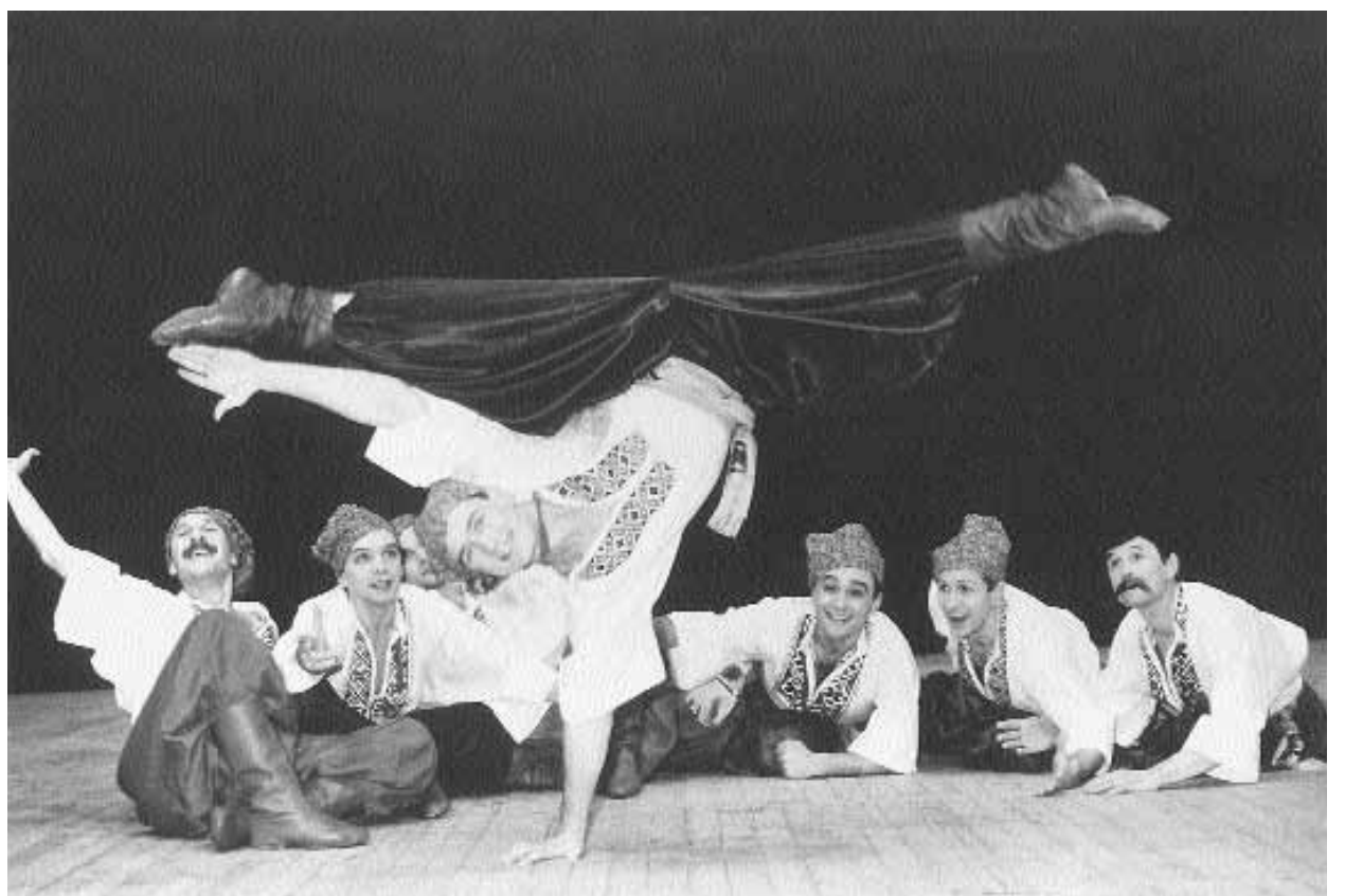
Men of the Virsky ensemble in one of the numbers showcasing their athleticism and grace.