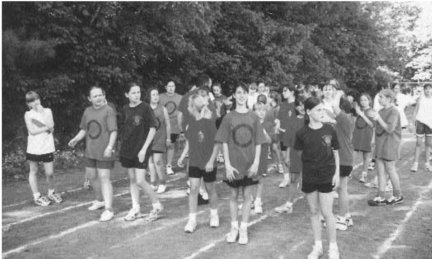
Runners prepare for race during SUM's annual "Zlet" in Ellenville, N.Y.

This year the responsibility for coordinating and conducting Zlet was undertaken by members of the SUM branch