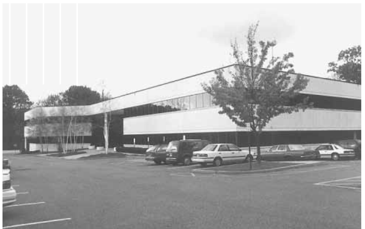
The new: the Ukrainian National Association's Corporate Headquarters in Parsippany, N.J.

In other UNA-related news, this year's UNA Almanac was dedicated to the 50th anniversary of Akcja Wisla, the forced deportation by the government of Poland of Ukrainians living in southeastern and eastern Poland to the country's northern and northwestern regions in an attempt to de-Ukrainianize ethnically Ukrainian lands and to ravage the Ukrainian minority.