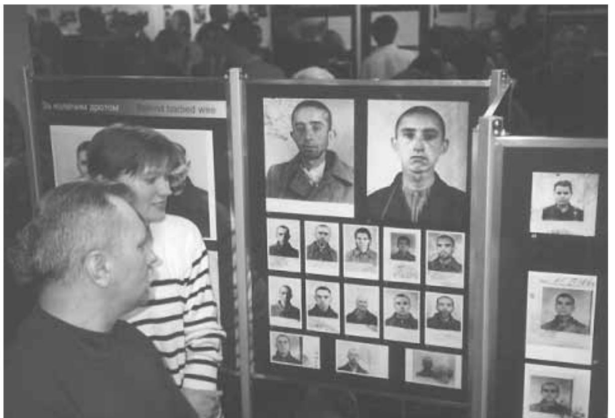
"Behind Barbed Wire": an exhibit on Akcja Wisla, which opened in Toronto on March 26.

The Pittsburgh community, where numerous survivors of Akcja Wisla and descendants of expatriated Ukrainians live, honored the memory of victims of Akcja Wisla on September 14. The New York community's commemorations spanned a week of events from October 17-26 that included a conference, a concert and an exhibit of photos and archival documents. The Toronto community organized an ongoing exhibit, which opened on March 26, of more than 200 photos