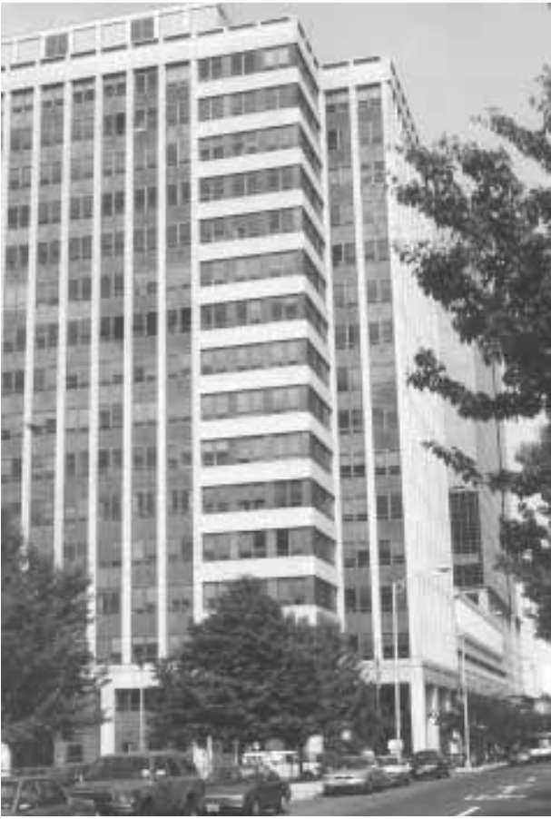
The old: the Ukrainian National Association's headquarters building in Jersey City, N.J.