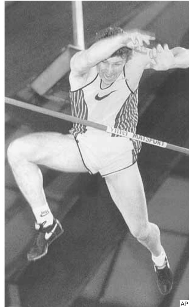
Sergey Bubka in classic form.

Unfortunately, Ukraine lacks Albion's depth, and on