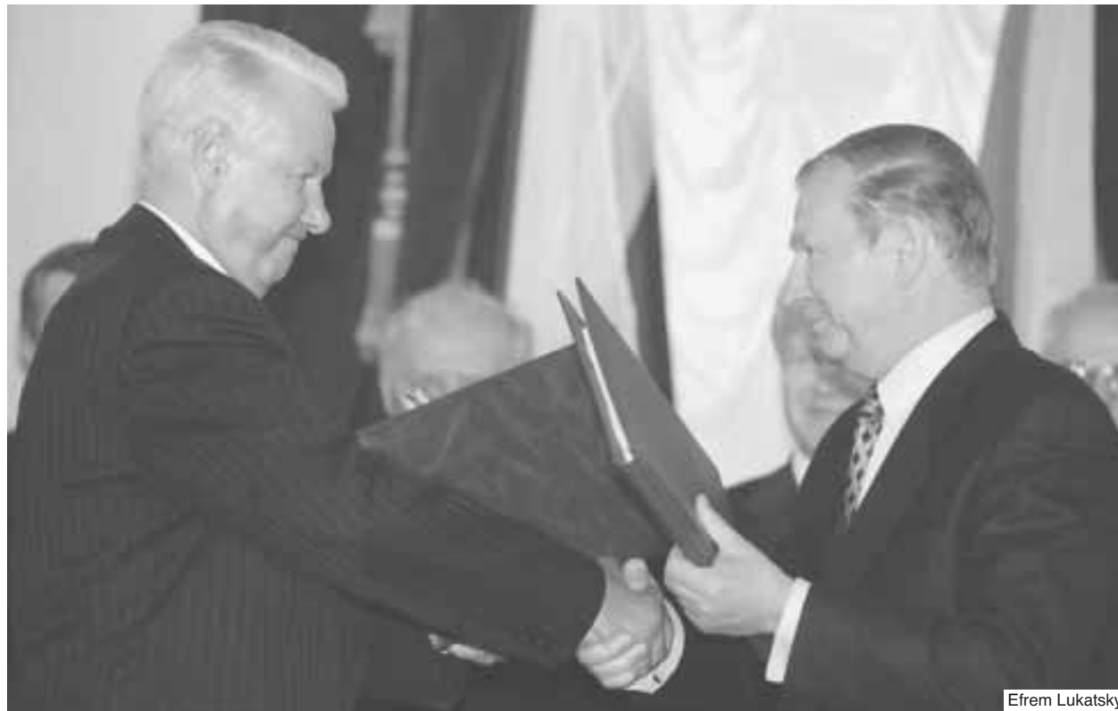
Presidents Boris Yeltsin and Leonid Kuchma sign the Treaty on Cooperation, Friendship and Partnership.

President Kuchma had begun his busy month of May by meeting in Kyiv with Belarus' controversial president, Alyasander Lukashenka, on May 12. The two sides formally delineated their 1,200-mile common border and worked to develop a repayment schedule for a $217 million debt