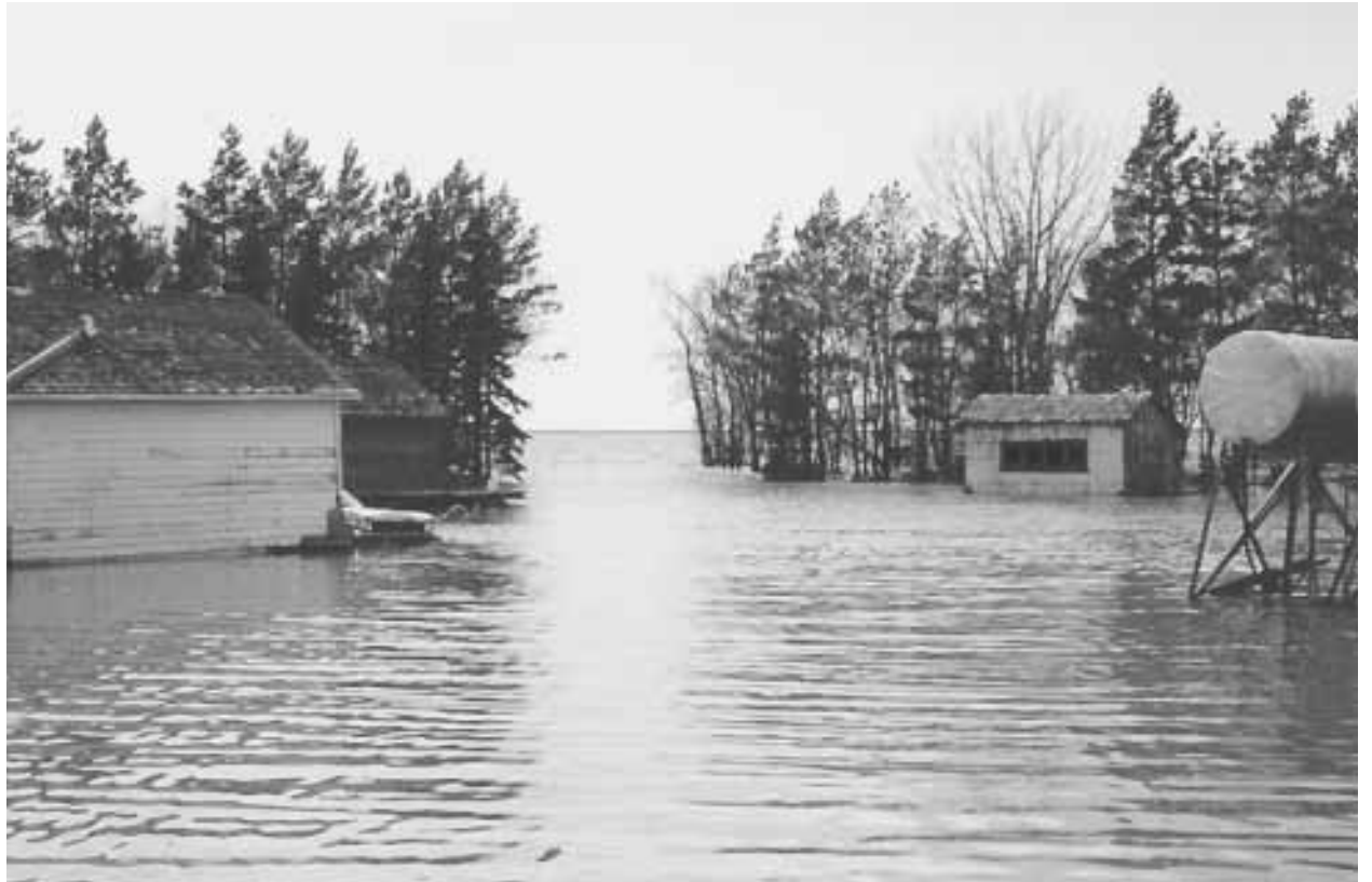
The Red River's flood waters in Manitoba.

Speaking in Parliament on October 10, Member of Parliament Indy Mark, who represents the Manitoba riding of Dauphin-Swan River, displayed a hand-written registry of enemy aliens interned at the Spirit Lake Camp in Quebec; the list contains the names of 257 Ukrainians interned there. Nearly all evidence of Canada's internment camps, save for this registry, had been destroyed by the government. Mr. Mark spoke out against the injustice done to Ukrainian Canadians and asked MPs to bring about justice and closure to this regrettable event in Canadian history.