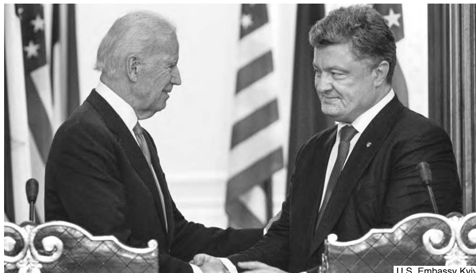
U.S. Vice-President Joe Biden with Ukrainian President Petro Poroshenko in Kyiv.

Mr. Biden also said Washington does not and will not recognize Russia's annexation of Crimea and will insist others also do not recognize it. He called Russia's annexation