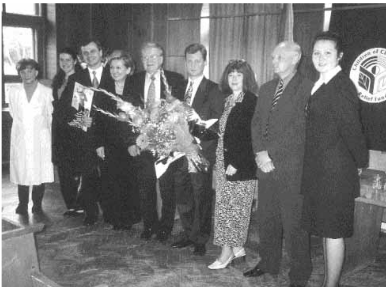
Former Olympic champion figure skater Viktor Petrenko (holding flowers) and representatives of the Children of Chernobyl Relief Fund with officials at the Odesa Children's Clinical Hospital.

– Polish President Aleksander Kwasniewski in an interview with Polish Radio on June 29.