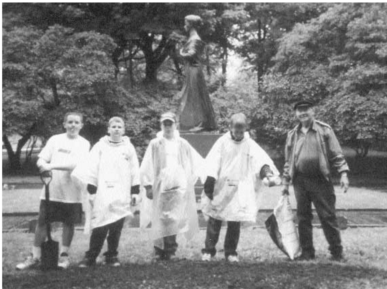
Some of the members of St. Josaphat's volunteer clean-up crew at the Ukrainian Cultural Garden. A statue of Ukrainian writer Lesia Ukrainka is seen in the background.