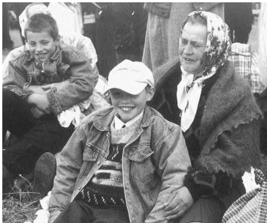
Some of the early arrivals on Sunday, June 24, at the site of the Kyiv mass await the start of the service.