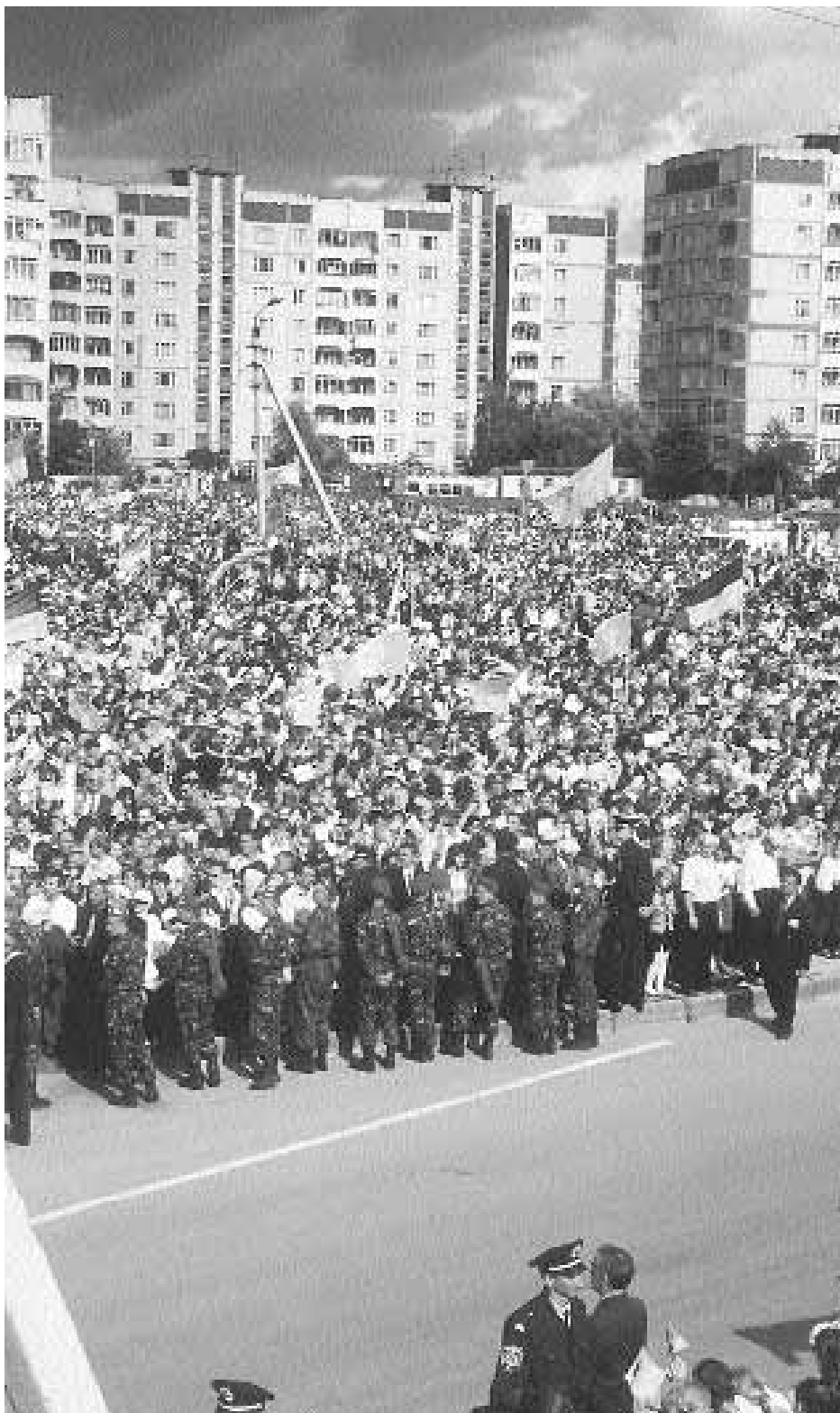
A sea of Ukrainian and Vatican flags awaits the arrival of the pope for the youth meeting in the Sykhiv area of Lviv on Tuesday, June 26.