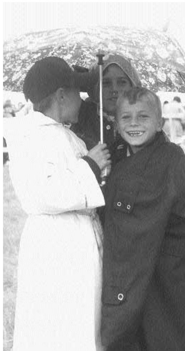
A trio of children during one of the cloudbursts that occurred during the Latin-rite mass at the Chaika Aerodrome in Kyiv on Sunday, June 24.