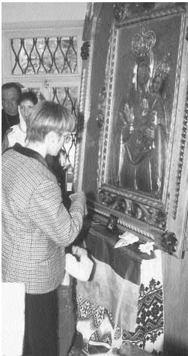
Pilgrims pray before the icon of the Mother of God of Zarvanytsia, which was brought to Kyiv to St. Nicholas Ukrainian Greek-Catholic Church.