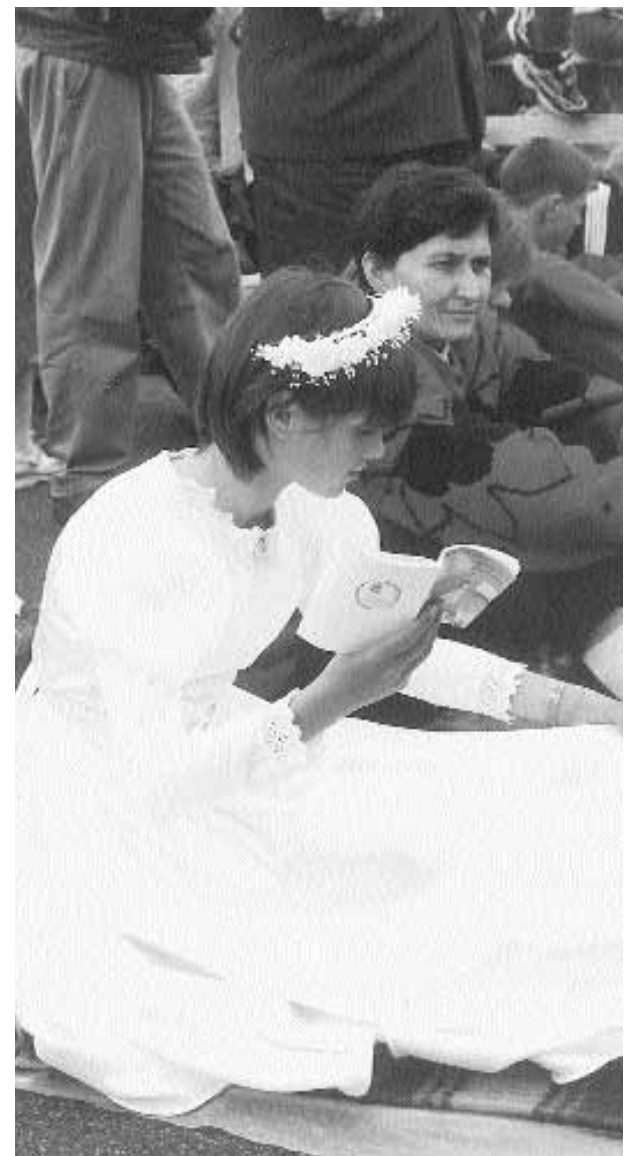
A young girl who was to receive her first holy communion prays during the mass celebrated in Kyiv on Sunday, June 24.