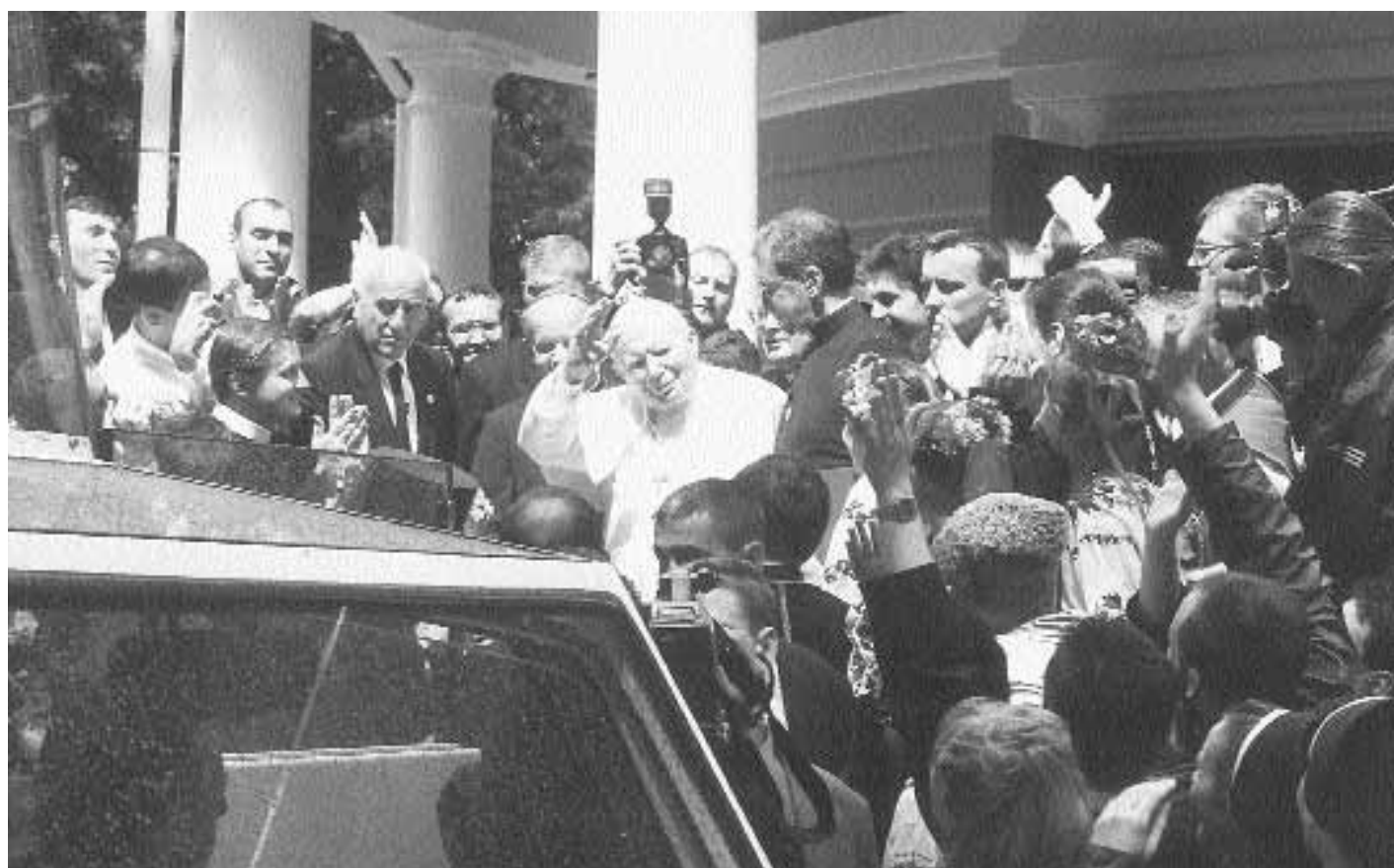
Pope John Paul II waves to the crowd gathered near St. Nicholas Ukrainian Greek-Catholic Church at Askold's Tomb in Kyiv on Saturday, June 23.

Holy Mother of God, spread your maternal mantle over all Christians and over all people of good will who live in this great nation. Lead them to your Son, Jesus, Who is for everyone the Way, the Truth and the Life.