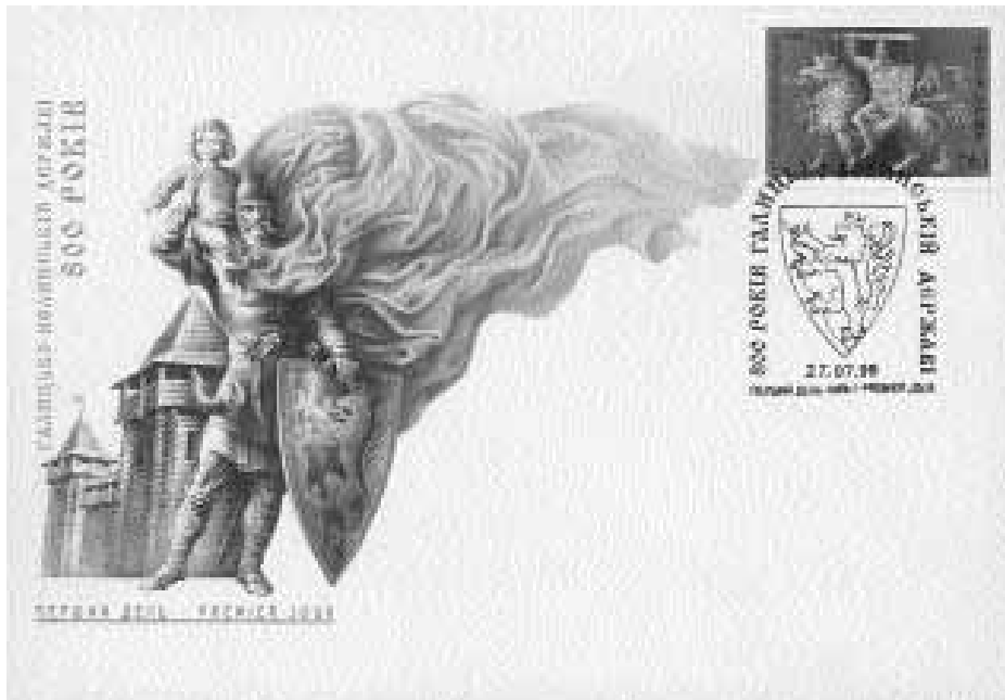
Figure 5. Korol Danylo had previously been depicted by Narbut Prize-winning artist Oleksii Shtanko on a 1999 envelope cachet commemorating the 800th anniversary of the Galician-Volynian State.