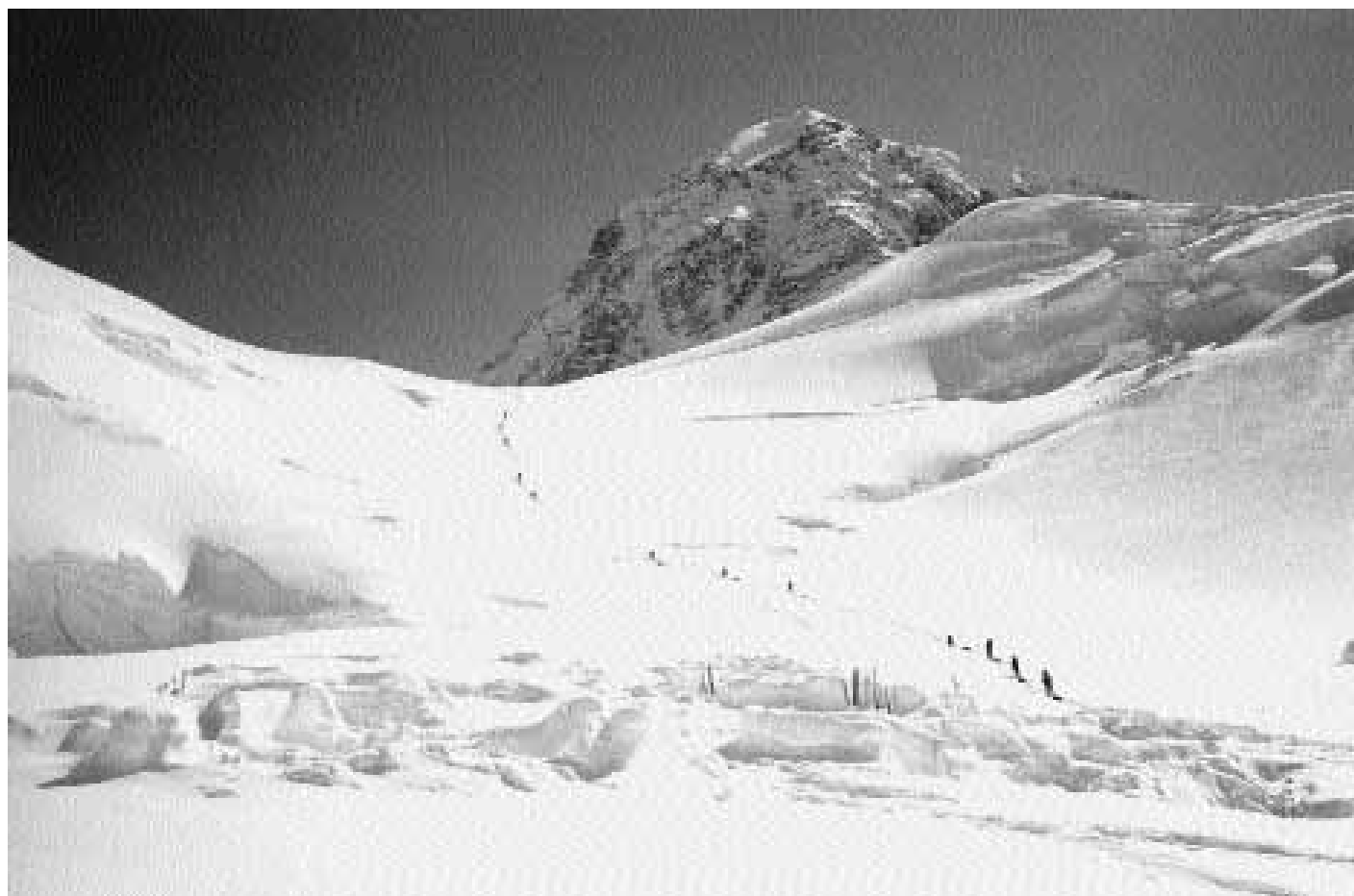
Climbing up Motorcycle Hill.