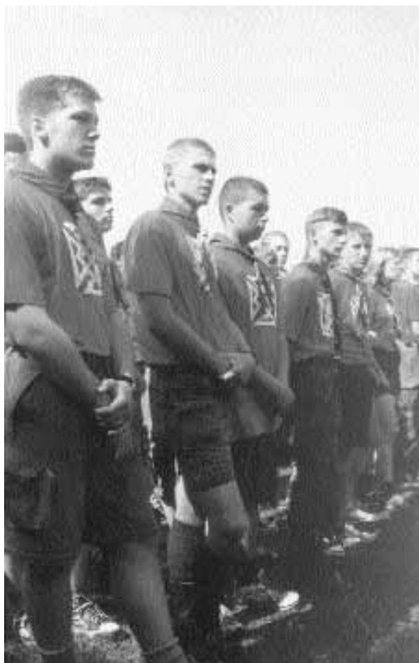
Members of the special camp devoted to military preparedness, "Zvytiaha."

By the time the last busloads had arrived in Svirzh on