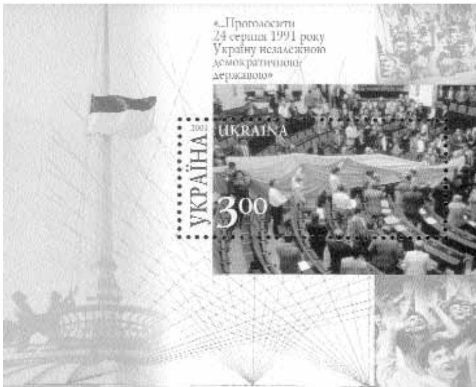
Figure 4. The 10th Anniversary of Ukrainian Independence souvenir sheet showed the first carrying of the Ukrainian flag into the Parliament chamber (a photo by Efrem Lukatsky) and the first raising of the blue-and-yellow flag over the Verkhovna Rada building (August 24, 1991).