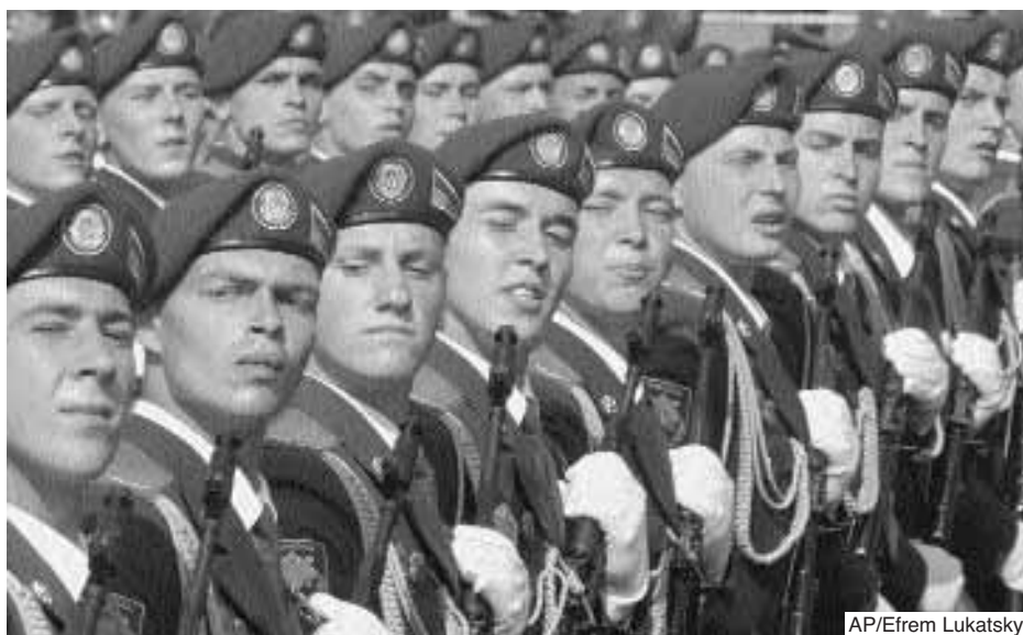
Soldiers of the special forces march down the Khreschatyk in Kyiv.