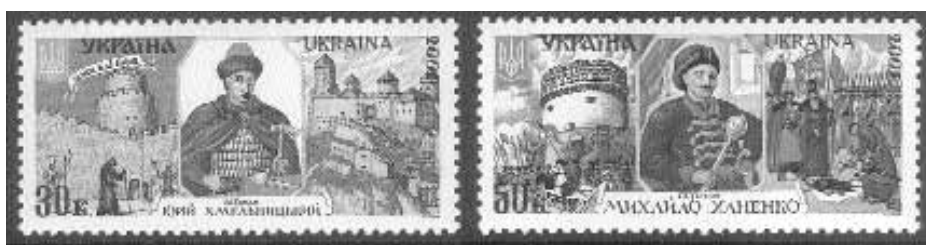
Figure 3. The two hetmans honored in 2001 were 17th century figures: Yuriy Khmelnytsky (1641-1685) and Mykhailo Khanenko (ca. 1620-1650).