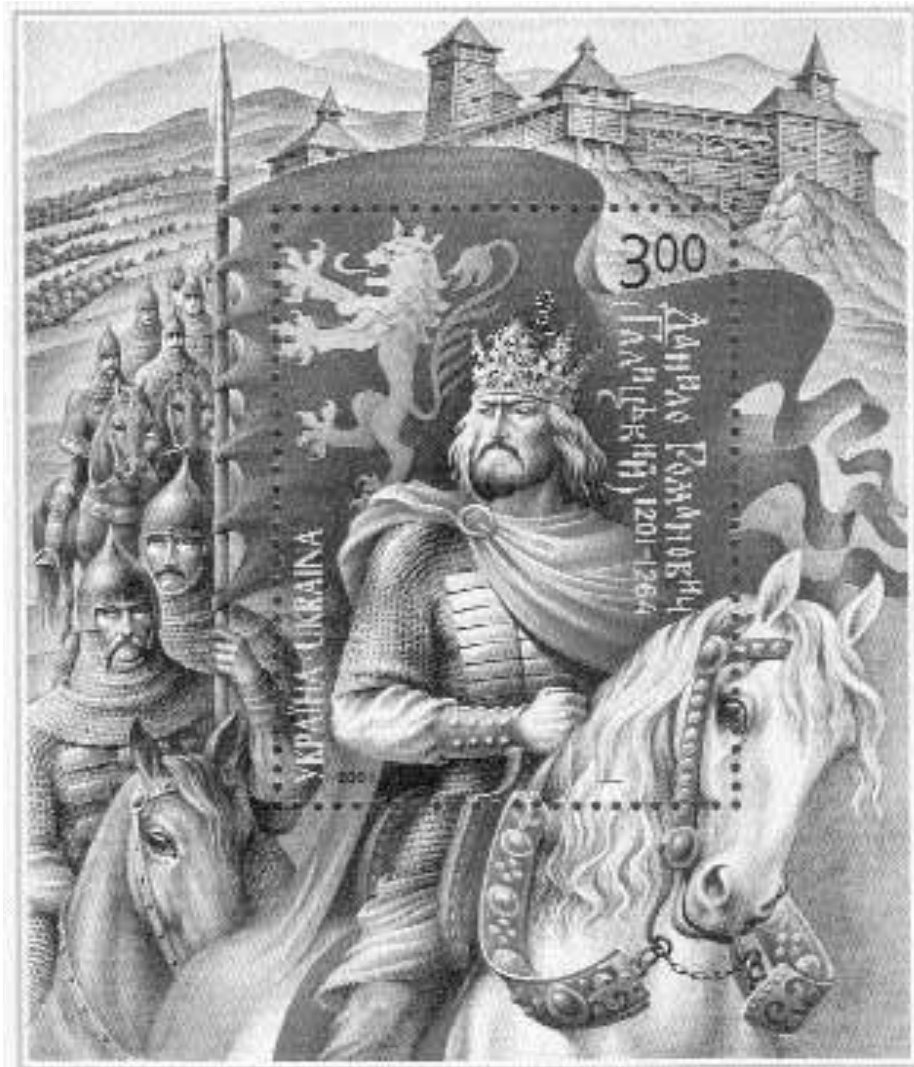
Figure 1. The winning design of 2001 showed Korol Danylo at the head of his troops. The medieval Lviv fortress is in the background.

A record number of voters took part in this year's Narbut Prize balloting that selected the Korol (King) Danylo souvenir sheet as the best-designed philatelic release of 2001 (see Figure 1). Amazingly, more than 80 percent of the hundreds of votes this year came from Ukraine, continuing a trend of heavy input from