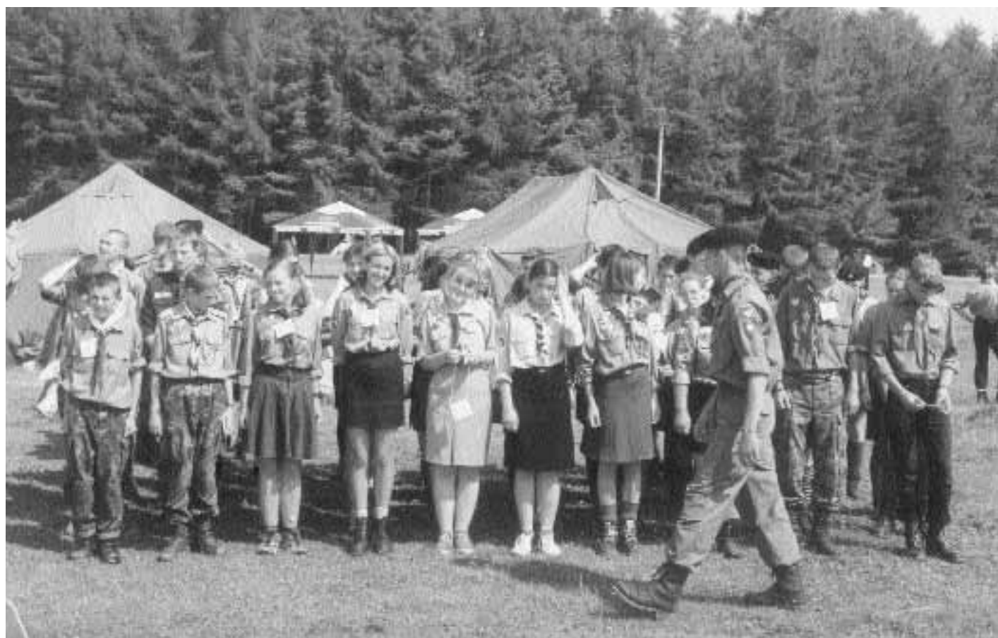
"Yunachky" and "yunaky" line up in preparation for the jamboree's opening ceremonies.