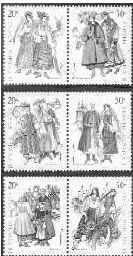
Figure 2. Second in the balloting was the Folk Costumes Issue. Prepared in both a souvenir sheet and stamp format, the designs depicted costumes from the Kyiv, Chernihiv and Poltava regions.