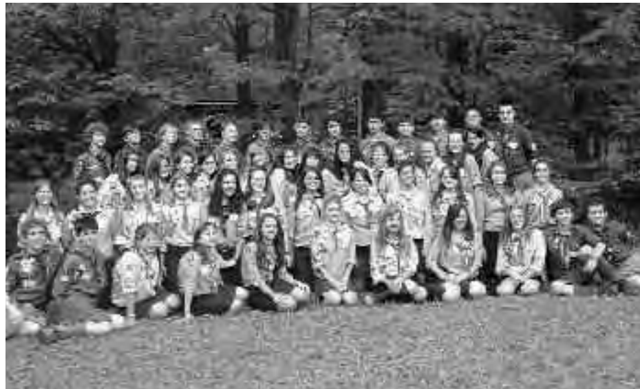
Trainees of "Vyshkil Novatskykh Vykhovnykiv" at Plast's Novyi Sokil campground in North Collins, N.Y.

Our assignments were just as diverse. We learned about what seemed like a very systematic approach to dealing with children.