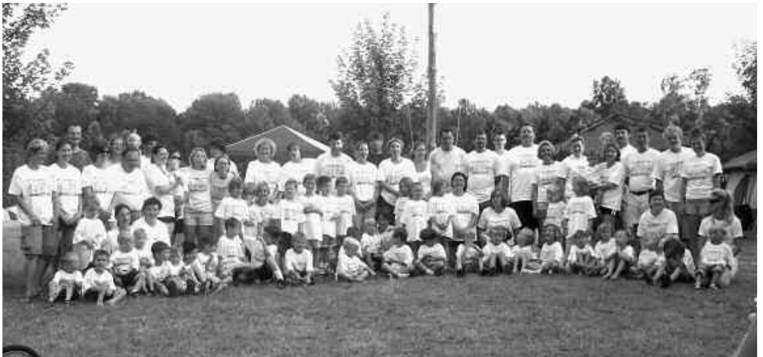
Participants of Tabir Ptashat 2006 at Plast’s Pysanyi Kamin campground in Middlefield, Ohio.