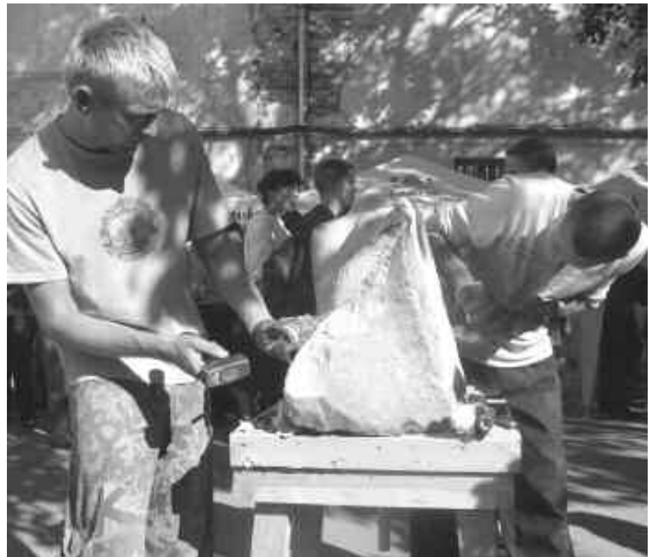
Students from the Lviv National Academy of Arts demonstrate their sculpting skills at the crafts festival.