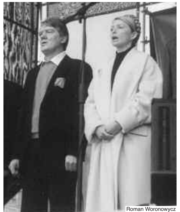
Viktor Yushchenko and Yulia Tymoshenko in happier times: at a November 2004 rally in Kyiv before the presidential election.

"Politically, he was necessary for her. She told him what he wanted to hear – that he would be president, that he was the wisest, the best leader. She knows