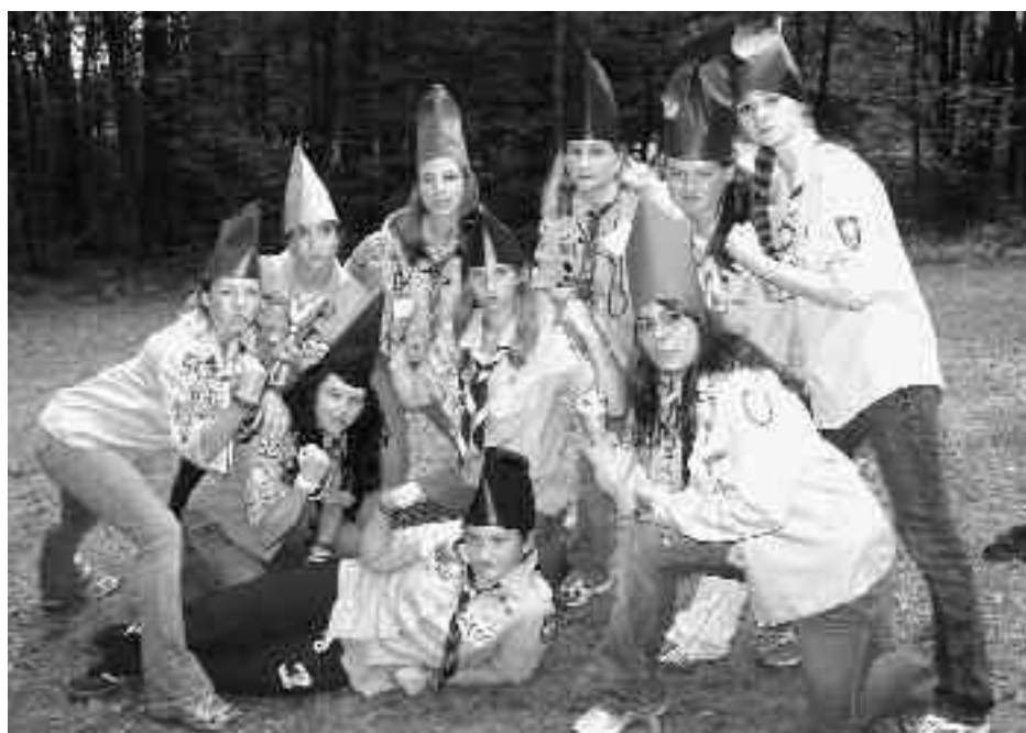
One of the "royi" at the counselor training course participates in a history-themed game.

"vykhovnyky" (counselors) repeatedly reminded us not to be scared, and assured us that we would be able to complete all the tasks assigned us.