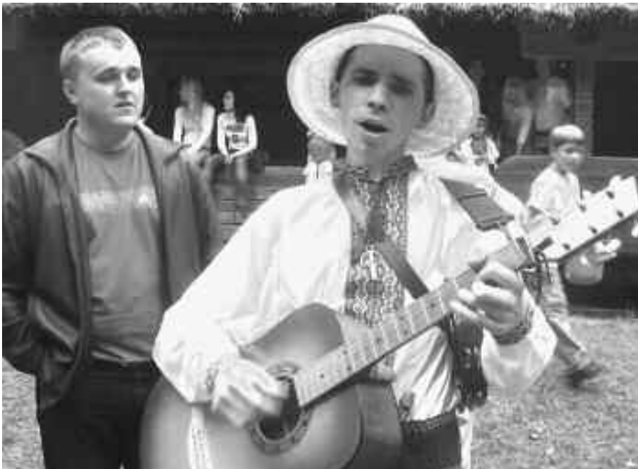
A guitarist sings Ukrainian folk songs at Lviv's 750th anniversary celebration on October 1.

Market Square, a fair consisting of more than 40 craftspeople and artists peddling their authentic Ukrainian wares was drawing interested crowds.