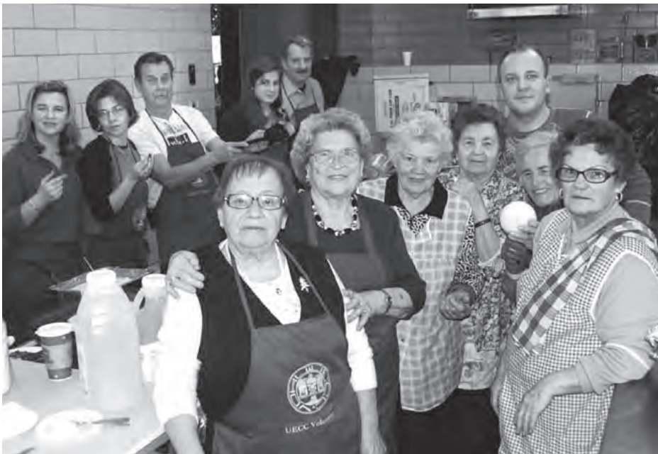
The small army of hard-working UECC kitchen volunteers.