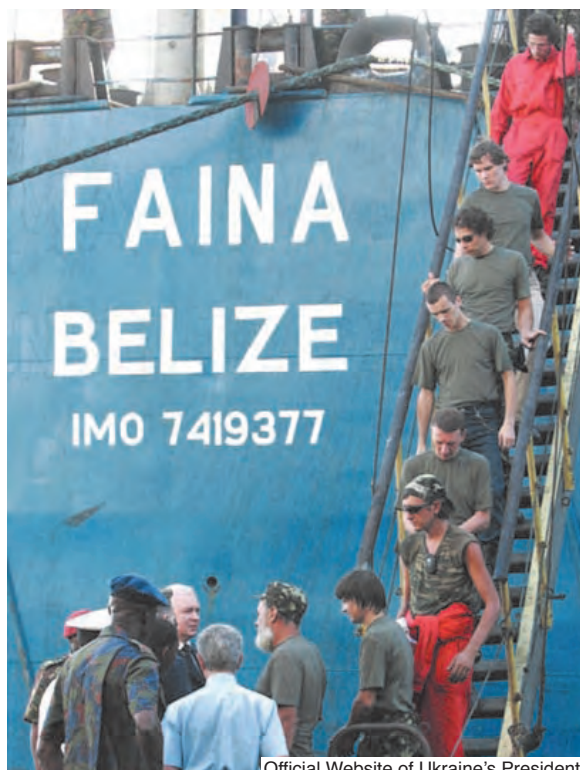
The MV Faina arrives in Kenya on February 9 after being released by Somali pirates.