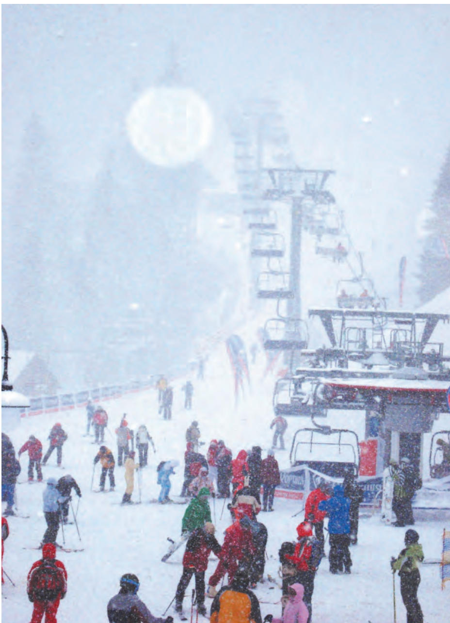
A view of the Bukovel Ski Resort.