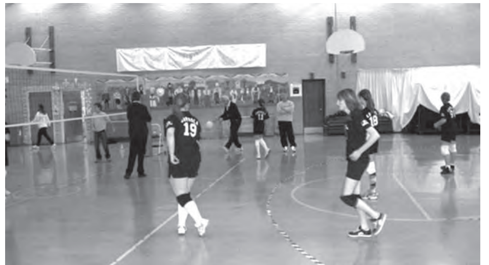
The girls' varsity volleyball team stages a scrimmage in the school gym for visitors.