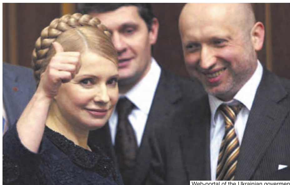
Prime Minister Yulia Tymoshenko reacts to the unsuccessful no-confidence vote in the Verkhovna Rada on February 5.