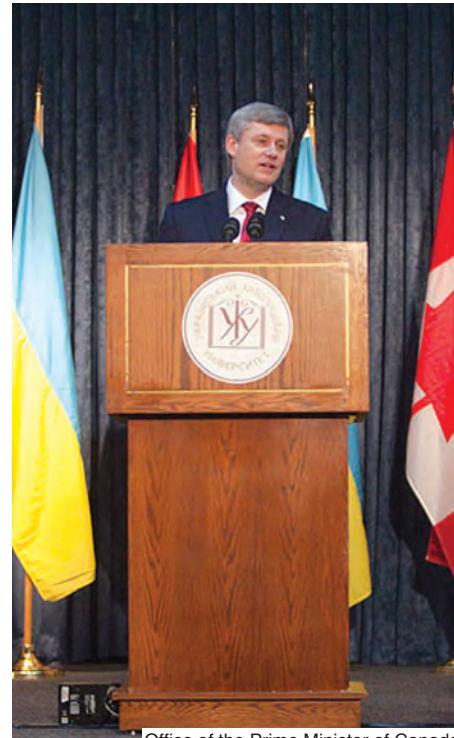
Office of the Prime Minister of Canada

Of course, through it all for years, for decades, thousands of Ukrainian Canadians demonstrated at every reasonable opportunity to raise awareness in the West of Soviet oppression. They did so because they knew all too well that their brethren back in Ukraine had no such freedom. And among the leaders of this Ukrainian Canadian van-