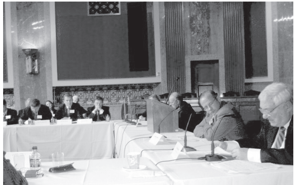
Dr. Yuri Shcherbak (right) participates in the Washington conference.

Committee and the Ukrainian Embassy in Washington hosted a patrons reception to honor the supporters of the Quest roundtable series. Representatives of perennial donating entities like Self Reliance New