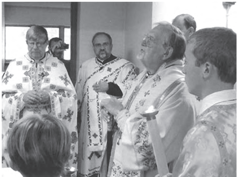
Metropolitan Constantine, together with parish clergy, blesses the newly remodeled St. Vladimir School building in Parma, Ohio.

St. Vladimir Cathedral's school building is used not only by the parishioners but by the entire Ukrainian community of Greater Cleveland. The parish sponsors a Sunday School, the Taras Shevchenko School of Ukrainian Students, and schools of Ukrainian dance, bandura and art.