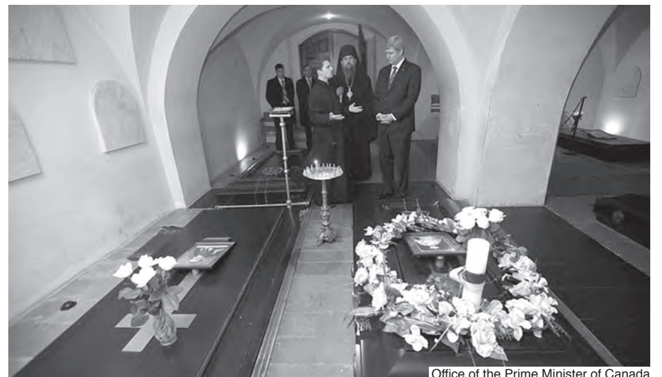
Office of the Prime Minister of Canada Prime Minister Stephen Harper during a visit to the crypt in St. George Cathedral, where leaders of the Ukrainian Catholic Church are buried.

The Prison on Lontsky Museum of particular significance since the director of the museum, Ruslan Zabilyi, who was working