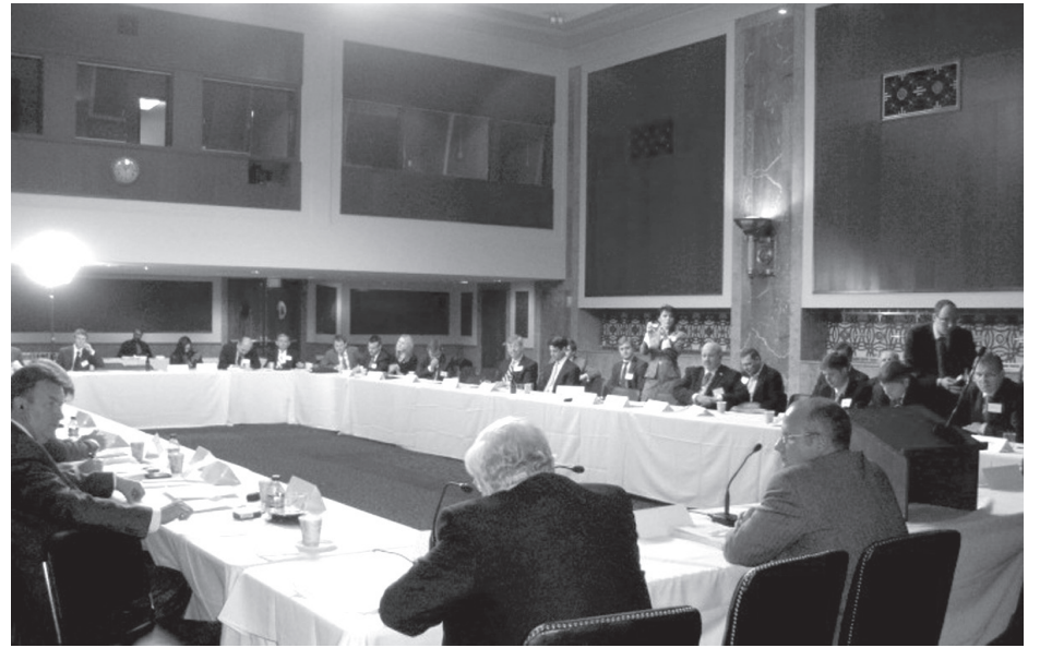
A view of the proceedings during the Ukraine Roundtable XI conference.