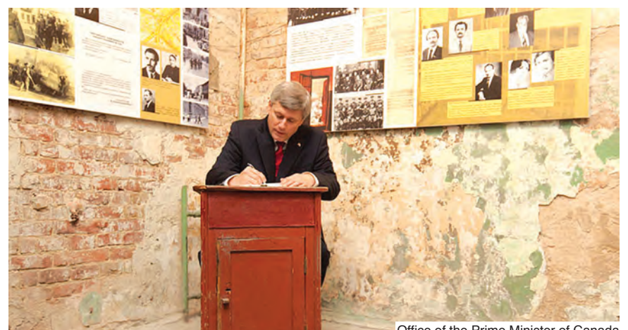
Office of the Prime Minister of Canada