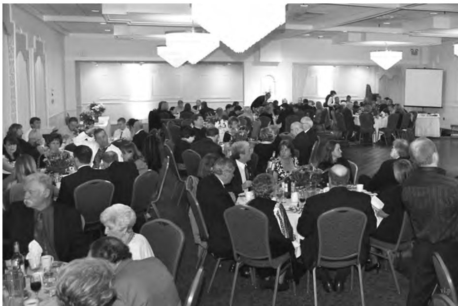
Attendees at the anniversary banquet.

Therefore, we call upon you, as elected officials, to fulfill your mandate from the Ukrainian people and withdraw the proposal from parliamentary consideration. It is nothing less than your duty and obligation to do so.