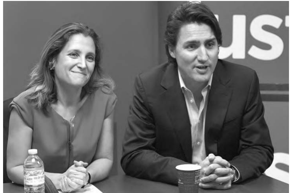
Chrystia Freeland and Justin Trudeau.

I am pleased with many policies of Canada’s Conservative government. What’s best, it supports democratic values and European integration for Ukraine. Shortly after ex-Prime Minister Yulia Tymoshenko was illegally imprisoned, Prime Minister Stephen Harper took a lead among democratic heads of state. He wrote to President Viktor Yanukovich, warning of “serious consequences” should he continue trampling on the rule of law. (The Canadian Group for Democracy in Ukraine lobbied for this letter. I’m a founding member.) Prime Minister Harper repeated the message once again last week.