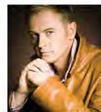
Pavlo Tabakov Singer, musician, composer, known as "The Ukrainian Sting"