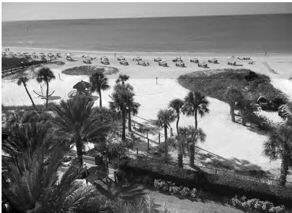
A view of Siesta Key Beach.