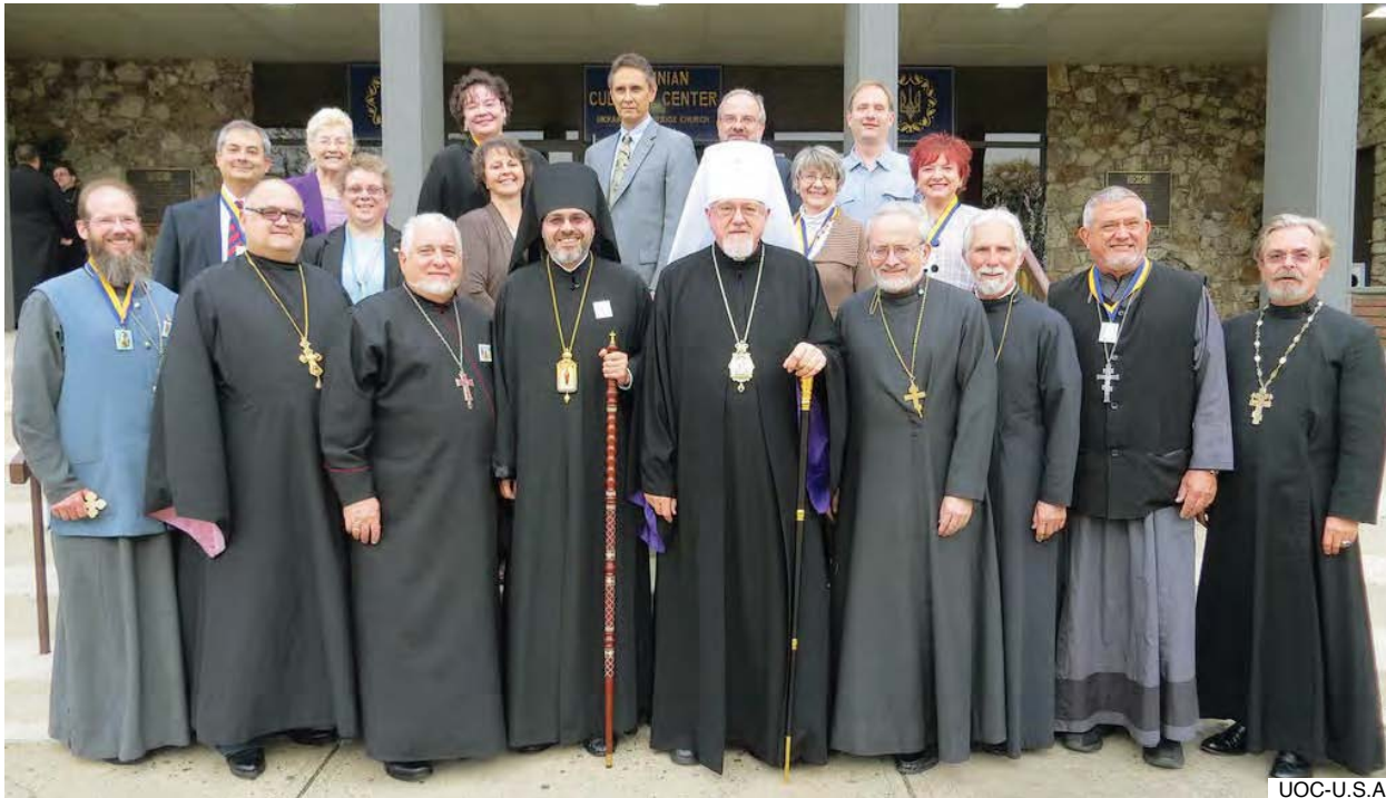
The Council of the Metropolia of the Ukrainian Orthodox Church of the U.S.A.