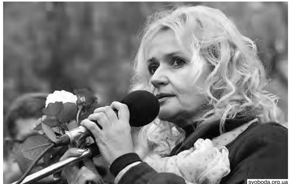
Outspoken Communist critic Iryna Farion, a national deputy of the Svoboda nationalist party, was herself a Communist Party member.

"Being a member of the faculty's International Friendship Club, she engaged in conversations with foreign citizens numerous times with the goal of their learning the Russian language better,"