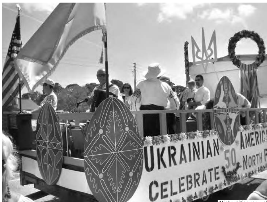
At the 50th anniversary celebrations of North Port, Fla., in 2009, the “Ukrainians on Parade” float won best of show.

Our corner of paradise extends from St. Petersburg to greater Sarasota, including Bradenton, Osprey, Venice, North Port and Englewood, to Fort Myers and Naples. This region is easily accessed by air via Tampa, Sarasota or Fort Myers international airports. There is even the opportunity to bring automobiles from the north via the very convenient overnight Amtrak Auto Train from the Washington, D.C., area to the Orlando area.