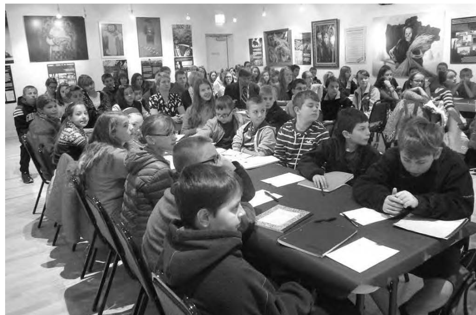
Students listen to the stories of Holodomor survivors at the Ukrainian National Museum.