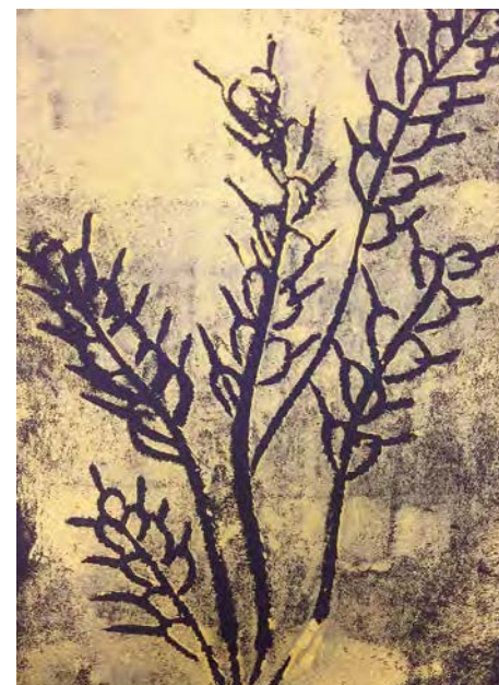
An example of student printmaking project.