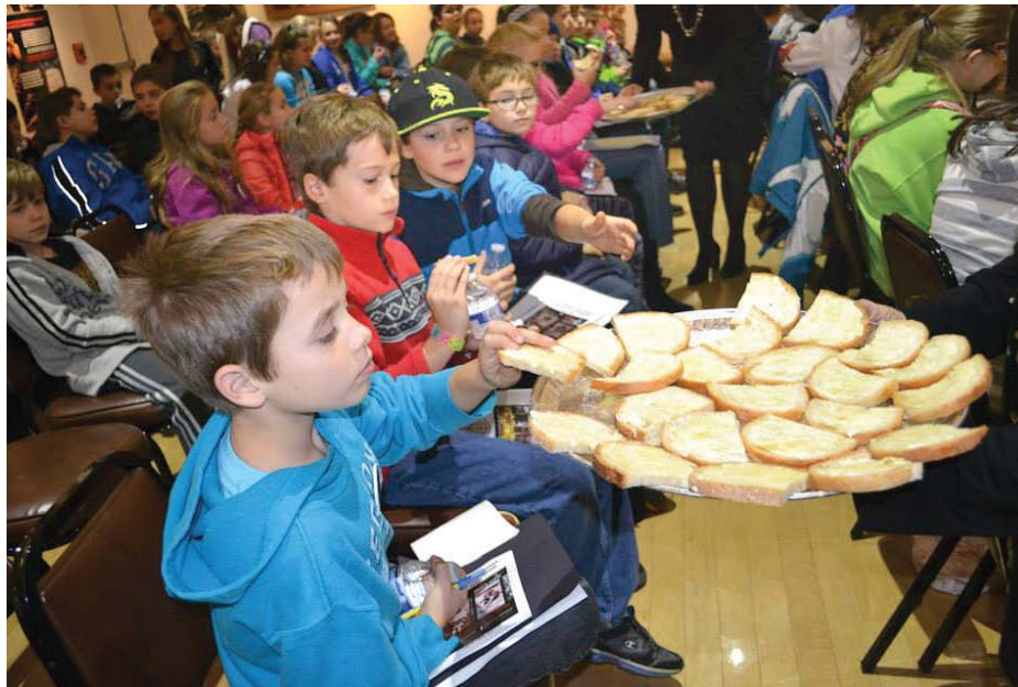
Students are served a small piece of bread with honey and water to commemorate those who had perished in the Holodomor.