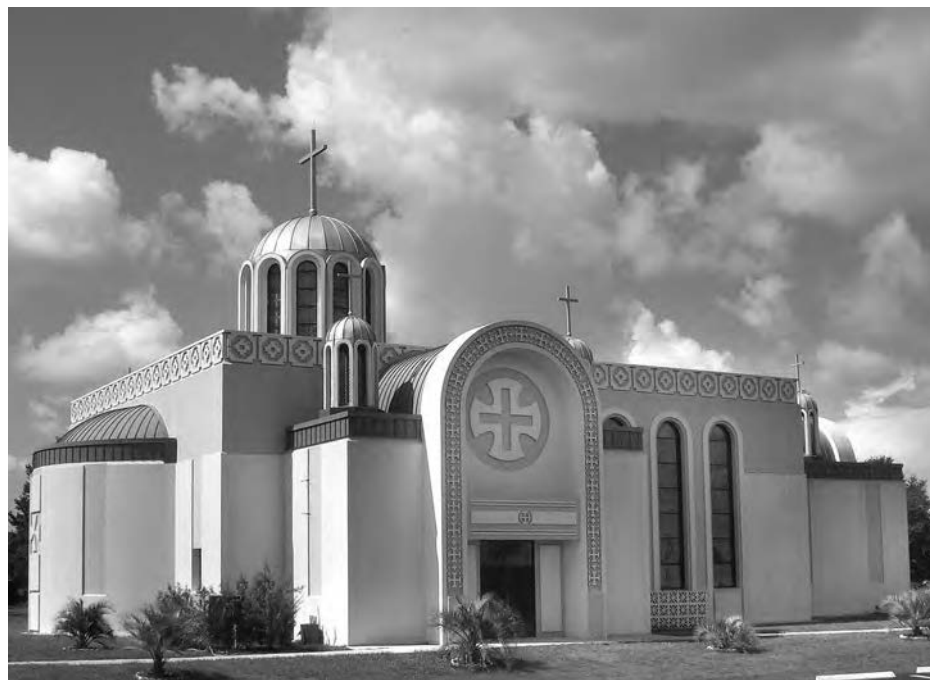
St. Mary Ukrainian Catholic Church in North Port, Fla.