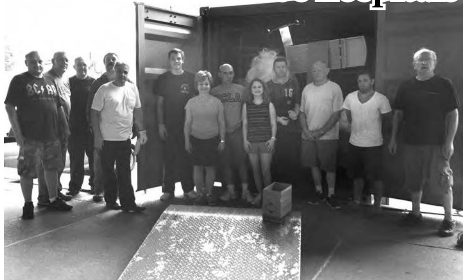
Volunteers of the United Ukrainian American Relief Committee at work in preparing a shipment of supplies to hospitals in Ukraine.

The collection of items from the 9,500-room facility required sorting and organiza-